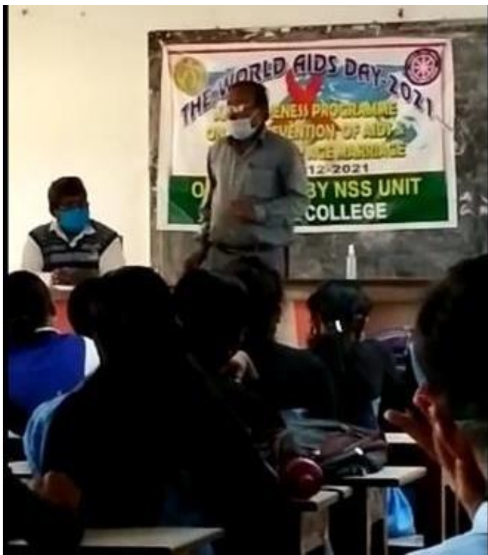
World AIDS Day Celebration

Celebration of National Youth Day was done on 12.01.2022 through organization of a webinar on 'Educational and religious thoughts of Swami Vivekananda and its relevance in present times'. The students who participated in this webinar gained knowledge on Swami Vivekananda's child life, his educational, moral and religious thoughts, how he spread education and Indian culture throughout the world and relevance of his thoughts in present times. The lecture was given by three Programme officer, Principal and IQAC co-ordinator of the college.