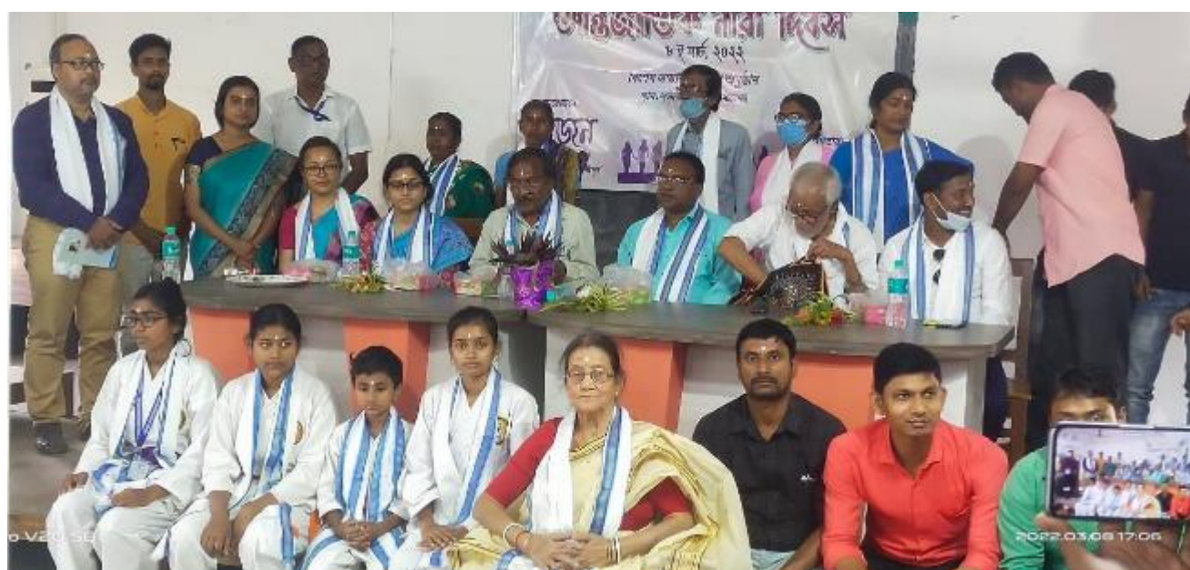
Celebration of International Women's Day