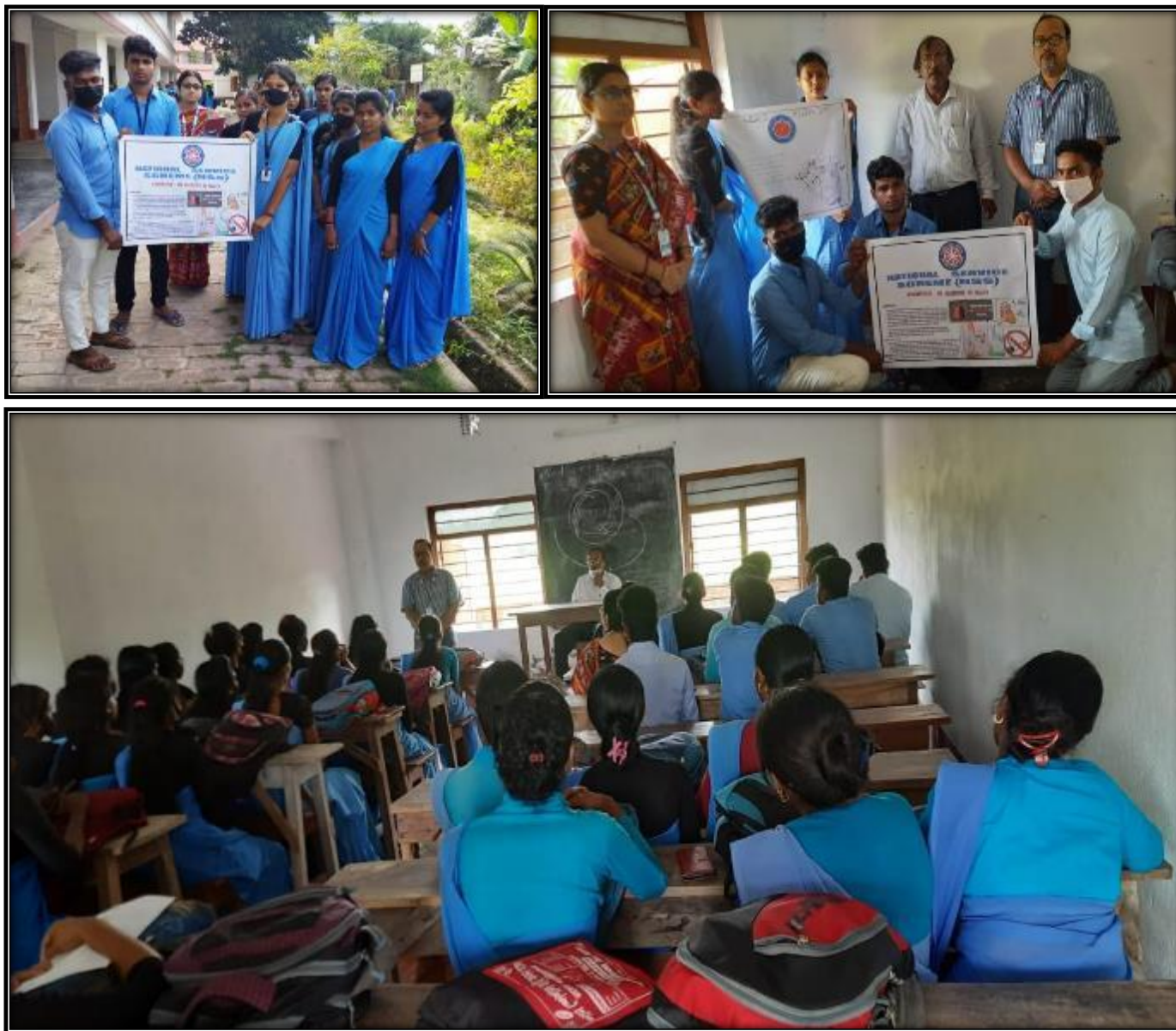
Celebration of World Health Day

Celebration of World Health Day was done on 07.04.2022 through organization of a seminar where a discussion on 'How to lead a healthy life?' was done. Besides, to increase awareness among the volunteers, poster presentations by the volunteers were also organized. The students were highly enriched through this programme. A total 150 volunteers have participated in the programme.