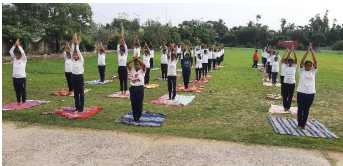
Practice of Asanas by volunteers on International Yoga Day at campus