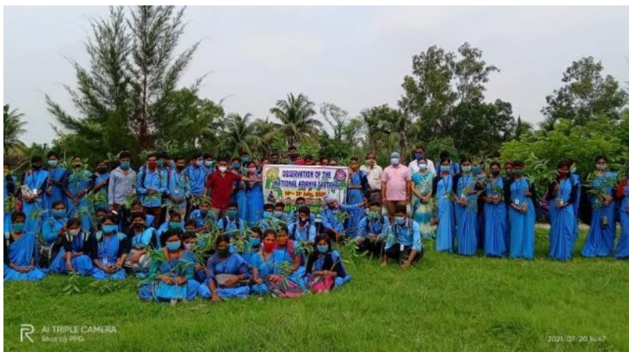
NSS volunteers posing with saplings distributed from College on the occasion of Aranya Saptaha