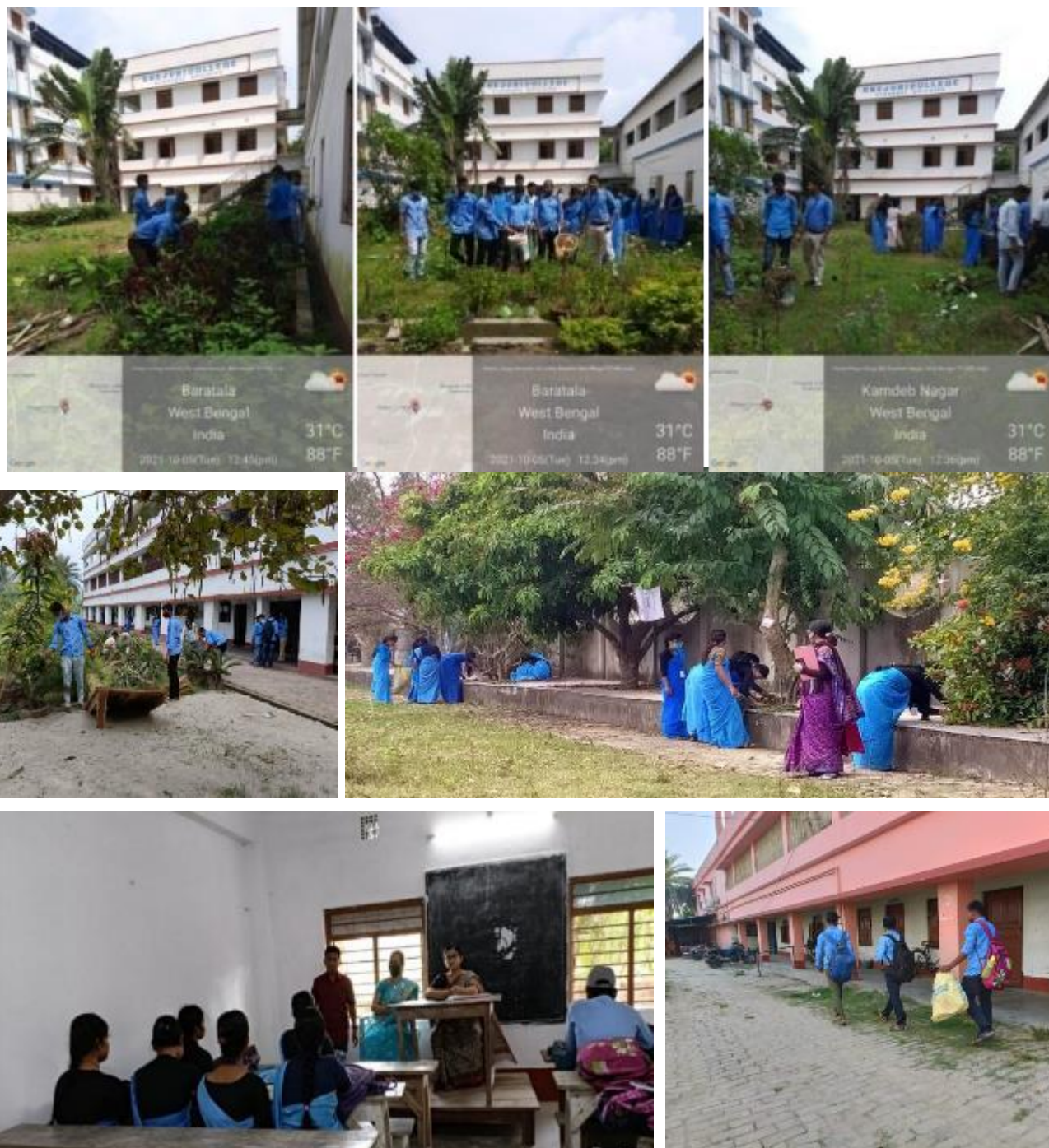
Activities during Swachhata Pakhwada (1 st – 15 th October 2021)